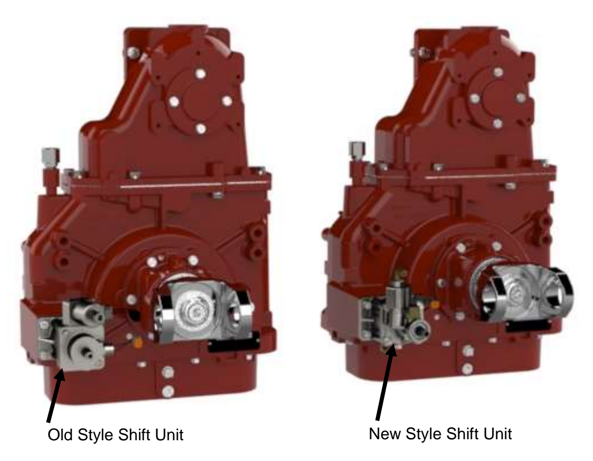
Figure A. Old and New Style Shift Unit Shown on C20 Transmission