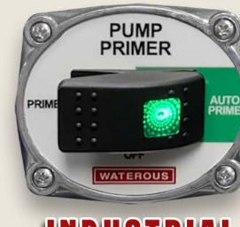
INDUSTRIAL AIR PRIMER