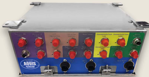
WATEROUS CONTROL BOX