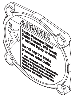
RELIEF VALVE OUTLET WARNING PLATE