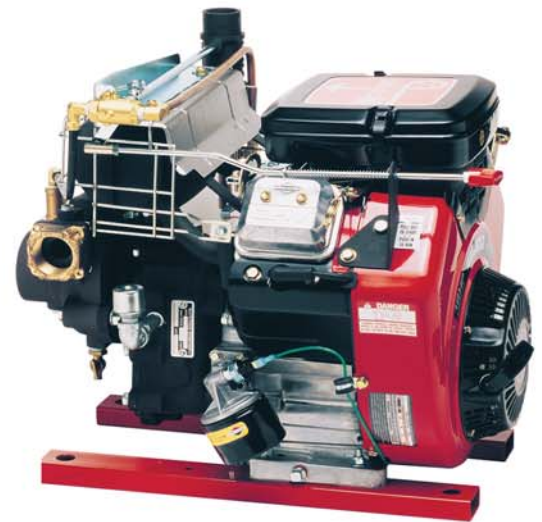
MAXIMUM FULL THROTTLE PERFORMANCE PB18-G2015

Designed for wildland/attack fire suppression, the rugged and powerful Waterous PB18-G2015 is a gear-driven centrifugal pump powered by a V-twin Briggs and Stratton® 18 HP (13.4 kW) engine and is available with no base or rail base option. Fuel tank is 3-gallon (11 liter) fuel tank that meets the EPA evaporative requirement (40 CFR Part 1060).